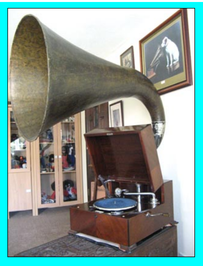
E.M.G. were responsible for producing some of the best Acoustic Gramophone Models in the World.

These Hand-made Gramophones are sought after by serious Collectors and discerning connoisseurs of the acoustic sound.